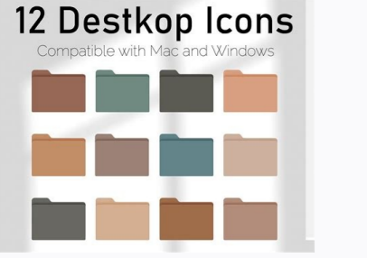
Mac windows icon png, Mac minimize windows into application icon, Mac icon pack for windows 10 free download, Mac os icon pack for windows 10, Mac os icon pack for windows 10 free download, Mac os folder icons for windows 10, Mac icons for windows 10, Mac icon pack for windows 10.

It is a common practice to use icons to represent applications and files on a computer desktop. The Mac OS desktop environment has a long history of using icons, and there have been many different icon packs and styles over the years. This document provides information on various Mac OS icon packs and styles, including a list of 12 desktop icons and a comparison of different icon formats. The 12 desktop icons shown in the image include: Finder (blue smiley face) System Preferences (grey gear) Spotify (green circle with three curved lines) Safari (blue compass) Photos (blue circle with 'Ps') Messages (blue circle with speech bubble) Music (blue circle with musical note) App Store (blue circle with 'A') Pages (green leaf) Keynote (purple circle with 'K') Numbers (orange circle with 'N') Numbers (purple circle with 'Ae') The document also discusses the importance of icon design, including factors like color, shape, and size. It mentions that icons should be easily recognizable and consistent with the overall system design. The document also provides information on how to create and use icons, including the use of different file formats like PNG and ICO.